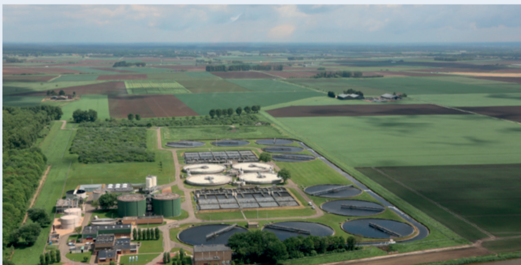
Fig 1. Municipal wastewater treatment plant BATH. This WWTP treats wastewater for 500,000 person equivalents and has the potential to supply biomass to produce 2000-2500 ton PHA/year [1] .

With the presence of nutrients in the fermentation feedstocks there is a risk for growth of non-PHA storing bacteria and that reduces the PHA process productivity [2] . Methods to promote the selective growth of the PHA-storing biomass while mitigating flanking population growth directly in a PHA accumulation process is a key to the reliable commercial PHA production. Bioprocess methods need to be optimized with help of a deepened understanding of influencing competition strategies for different kinds of bacteria that comprise the WAS biomass.