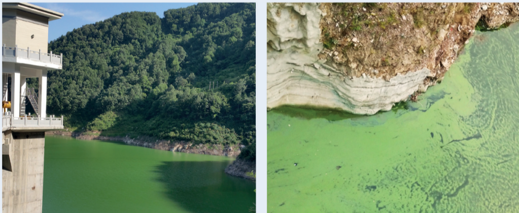
Fig 1. Eutrophic reservoir with algal bloom.

Phosphorus management is key issue in wastewater treatment. While phosphorus is a vital plant nutrient crucial for agriculture, its excessive presence has well-documented detrimental effects on the natural environment, including eutrophication, algal blooms, and aesthetic and recreational impacts [1] . The Water Framework Directive required EU Member States to achieve good status in all surface water bodies by 2027 [2] . Given the eutrophication threshold of 10-15 ug/L [3] , it becomes important to efficiently remove phosphate during wastewater effluent polishing to mitigate eutrophication. Among the potential solutions, adsorption presents itself as a valuable approach for waters contaminated with low levels of phosphate. Given the abundance, affordability, and ease of synthesis of iron oxides, there is growing interest in employing iron minerals for phosphate recovery [4] . However, while much research focus on developing adsorbents from the adsorption perspective, the regeneration and reusability aspects still lack a comprehensive understanding. Addressing this gap in knowledge is a vital next step in advancing the field and enhancing economic viability [5] . By gaining insights into the regeneration of adsorbents, we can refine and optimize the entire process, moving closer to sustainable and efficient phosphate removal in wastewater treatment.