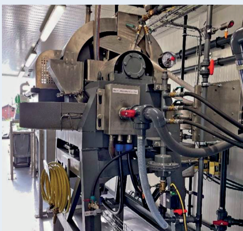
Fig 1. Magnetic separator in the pilot plant

Two main valorization routes exist: (i) direct use of vivianite, such as \text{LiFePO}_4 batteries [3], and (ii) separation of Fe and P, enabling circular reuse of Fe as a coagulant and recovery of P for fertilizer or chemical use. The role of impurities in these two routes may differ and cannot be generalized. For example, organic matter may serve as a useful carbon source in \text{LiFePO}_4/\text{C} synthesis, whereas it could negatively affect leaching efficiency during Fe-P separation.