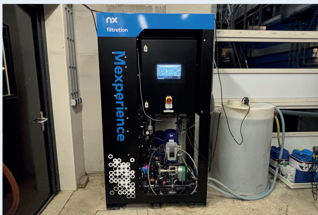
Fig 1. Nanofiltration unit used during the project

Lastly, the impact of greywater quality on membrane ageing and irreversible changes to the membrane requires more attention.