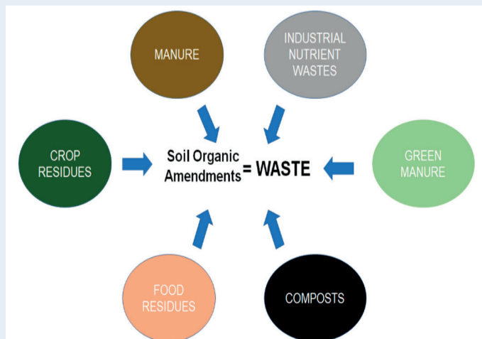
Figure 1. Practical sources of soil organic amendments.

This knowledge gap hampers the possibility of developing effective agricultural strategies able to enhance EPS formation in soil.